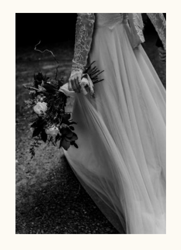
14:00 - 16:00

Symbolic ceremony under the mother oak tree, followed by welcome cocktails and canapés